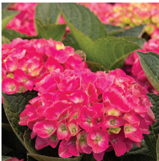
MARTHA'S VINEYARD HYDRANGEA ZONE: 4-9