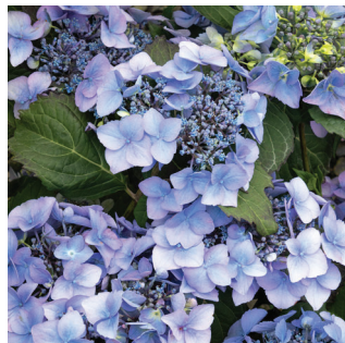
OUTER BANKS HYDRANGEA ZONE: 4-9