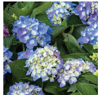
CAPE COD HYDRANGEA ZONE: 4-9