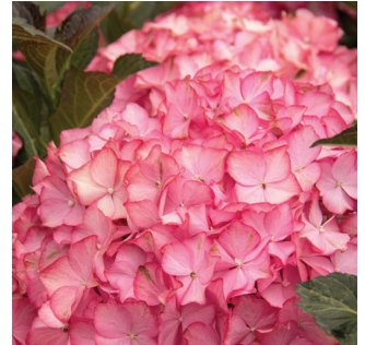
HAMPTONS HYDRANGEA ZONE: 4-9