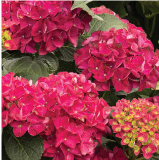
CAPE HATTERAS HYDRANGEA ZONE: 4-9

Flowers last longer in the garden and when cut.