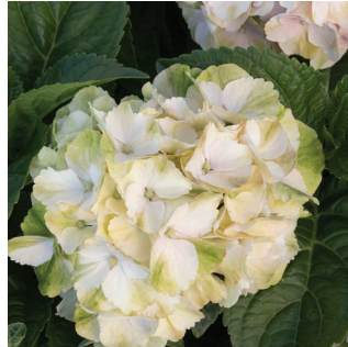
CAPE LOOKOUT HYDRANGEA ZONE: 4-9