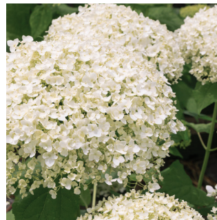
BAR HARBOR HYDRANGEA ZONE: 3-9 *Arborescens type