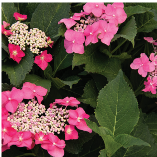
CAPE MAY HYDRANGEA ZONE: 4-9